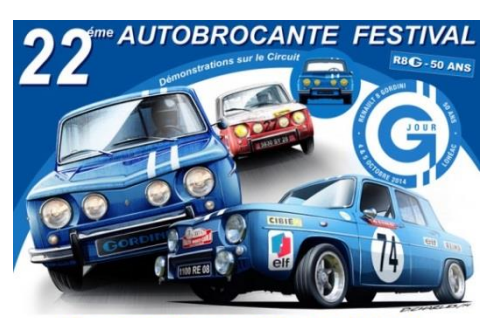
Manoir de l'Automobile de LOHEAC

Gordini: your vehicle can be parked in the "Gordini" village from Saturday 4<sup>th</sup> October from 09:00 am.